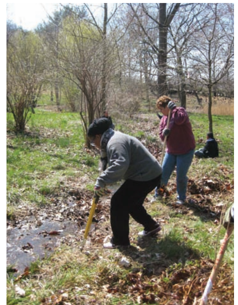
Volunteers clear debris from the wetland area